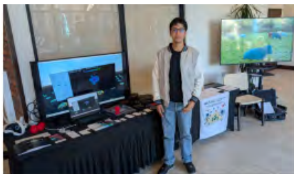
Ag100 AI Zone with Leonardo